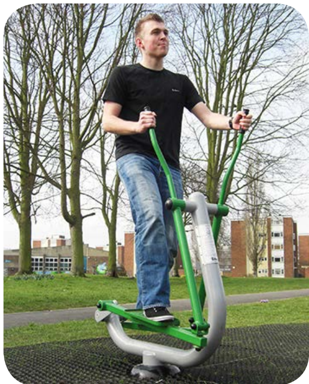
Unit Dimensions (mm) LxWxH : 1140 x 700 x 1650