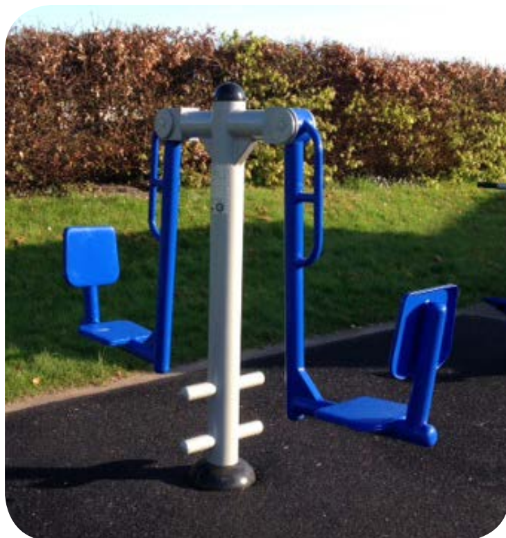
Unit Dimensions (mm) LxWxH : 2080 x 460 x 1670