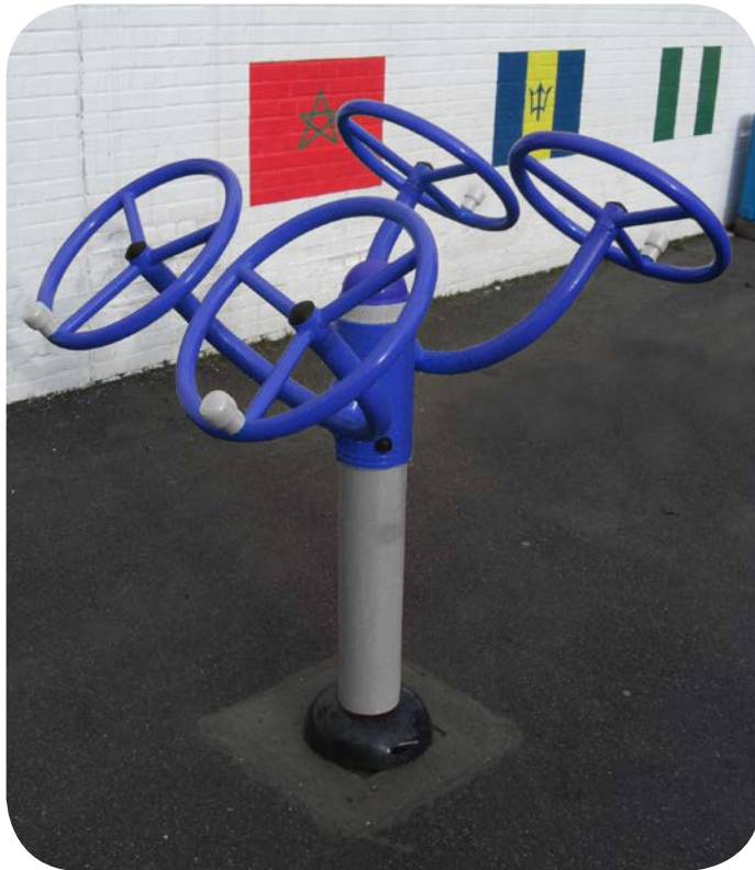
Unit Dimensions (mm) LxWxH : 1100x1010x1380