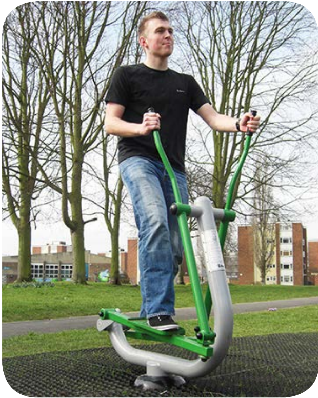
Unit Dimensions (mm) LxWxH : 1140 x 700 x 1650