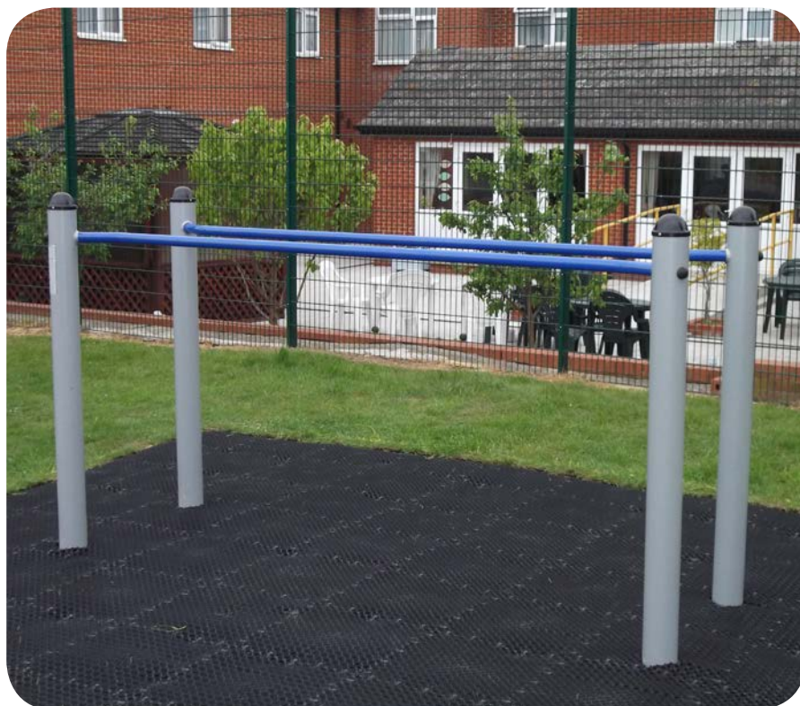
Unit Dimensions (mm) LxWxH : 2669x837x1557