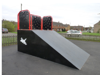
Flatbank 1.5m High 2.4m Wide 4m Long

The riding surface is coated with a specialist protective paint to help deaden sound and is a tough, hard, durable coating used in the automotive industry to protect against stone chips, salt, damp and rust. This provides a great skate surface, is super tough and vandal resistant.