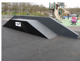
Funbox 0.9m High 1.2m Wide 5.6m Long