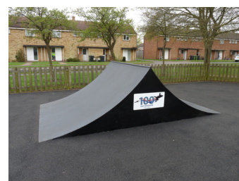
Spine Ramp 1.2m High 2.4m Wide