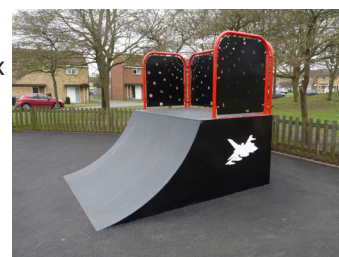
Quarter Pipe 1.2m High 2.4m Wide 3m Long

www.caloo.co.uk 01296 614448 info@caloo.co.uk