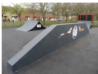
Handrail Box 1.4m High 0.4m Wide 8.6m Long