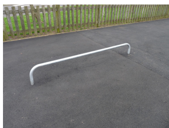
Grind Rail 0.3m High 2.4m Long