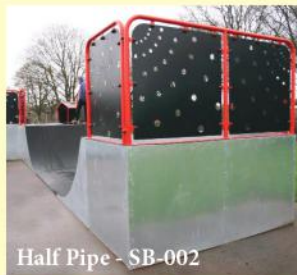
Half Pipe - SB-002

Step Grind Triple - H 0.9m x W 0.9m x L 3m