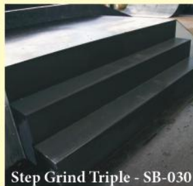
Step Grind Triple - SB-030