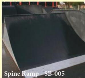
Spine Ramp - SB-005