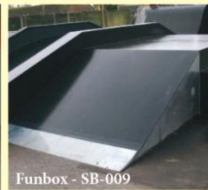
Funbox - SB-009