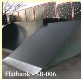
Flatbank - SB-006