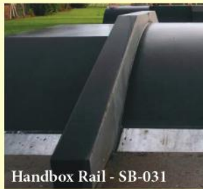
Handbox Rail - SB-031