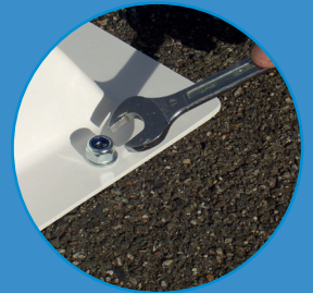
Can be fixed to existing tarmac, concrete or grass.