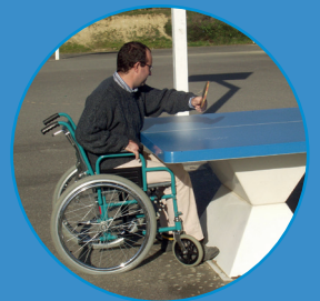
Easy to install