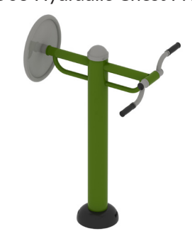
CW-70 Seatless Arm Bike & Wheels

The Full Body Community Bundle offers a complete workout for the user. With four strength based hydraulic units, one wheelchair accessible and one cardiovascular unit this offers a complete workout for all muscle groups. The units can be installed directly into tarmac or grass or we can supply a wide range of safety surfacing options.