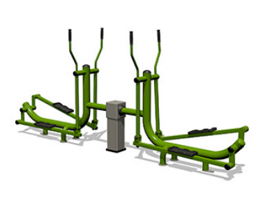
CW-05 Cross Rider Duo