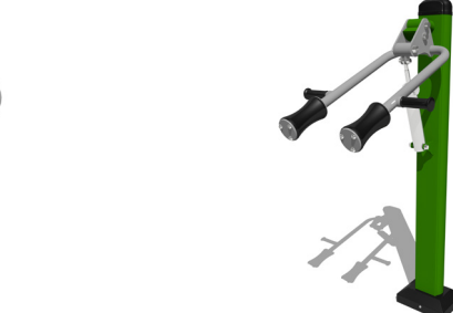
HD02 Hydraulic Squat Machine