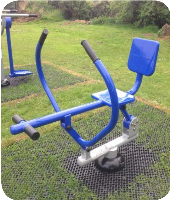
Unit Dimensions (mm) LxWxH : 1310 x 1010 x 1175